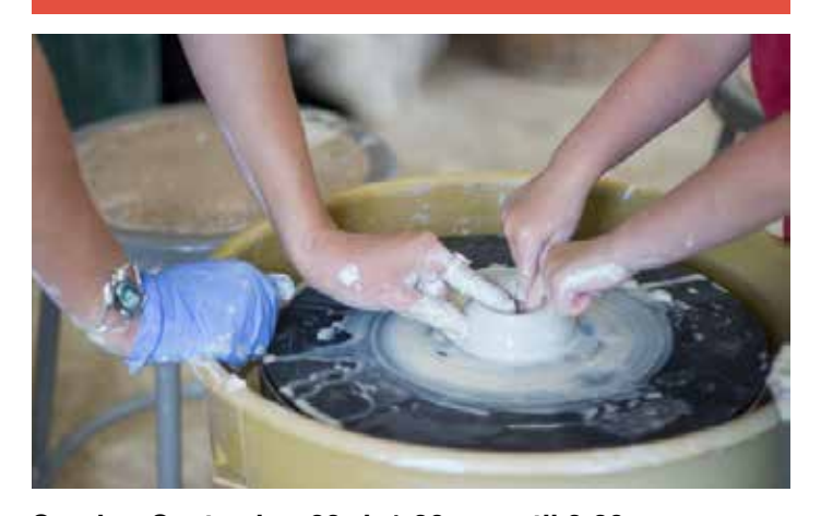
Sunday, September 23rd 1:30pm until 3:30pm (Children Ages 3+ and an Adult)

Participants will learn the basics of working on the potter's wheel. They will learn to wedge, center, and pull the clay to make a simple form. Participants will choose 1 or 2 of their best attempts to be glazed with a beautiful blue.